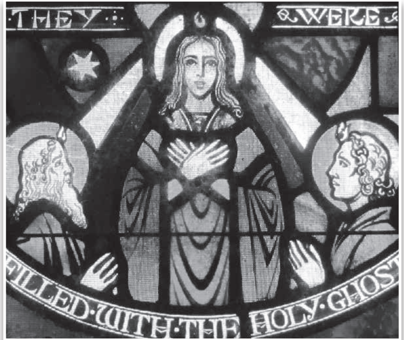
St. Maria Goretti chapel window

At that moment I realized that this was how Jesus had told the people to call God; this was the way He had invited them to cry out to His Father in their need. The relationship to which He had invited them and us is that of a child to its loving father, to His Father, the Father of Jesus. And Jesus continued to speak in this way, even though He must have known that what His continuing to teach as He did would cost Him.